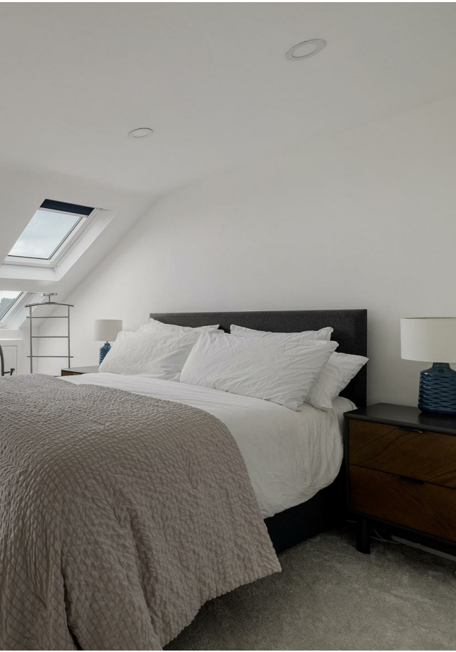
Bedroom 13'8" x 12'10"